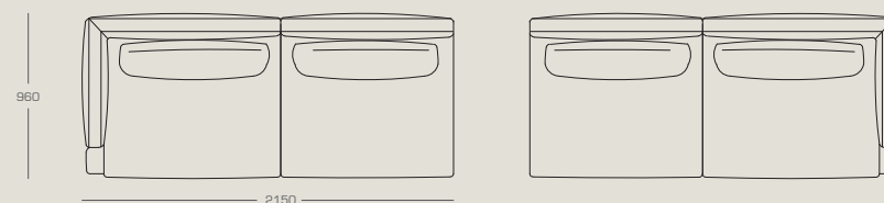
opia 210 1-am RHF:10005-42